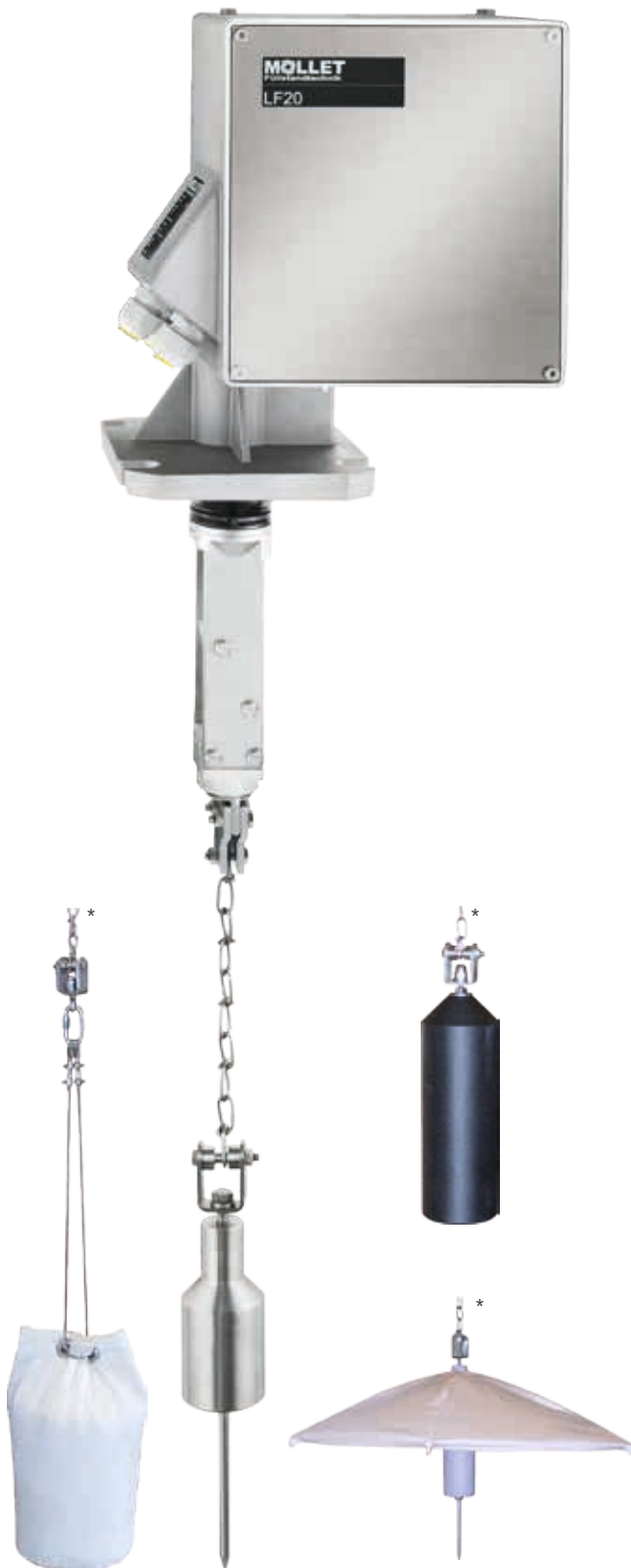
* Optional sensing weights